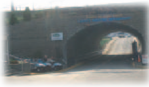
Entrance to the racetrack

FMCA's 76th International Convention, dubbed "Fast Track To Fun", took place August 14-17, 2006 at the Lowe's Motor Speedway in Charlotte/Concord, North Carolina. It drew 4,158 registered coaches, which included 3,105 family coaches and 1,053 commercial coaches. FMCA has issued over 380,000 Goose Eggs and currently we have 490 active chapters.