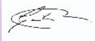
President and Chief Executive Officer