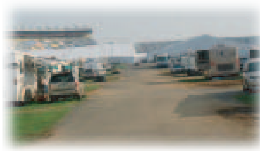
The exhibitors were in the tents

This was the first time that we used a speedway for the display of the latest motorhomes, complimented with many educational seminars, craft classes, and tours of local attractions. There are a good number of speedway sites available throughout the country. I would like to hear your comments and suggestions on using speedway sites in the future. Just drop me a short letter or email with your comments.